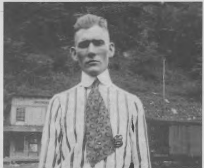
Matewan Police Chief, Sid Hatfield, was hired to “clean up” the rough and tumble town in 1919.

The mines of southwestern West Virginia were among the last in the state to become unionized