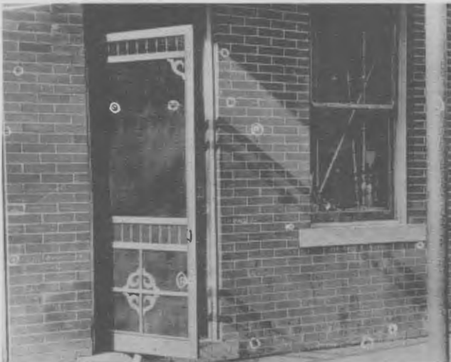
A bullet-ridden doorway believed to be that of the Chambers Hardware store where the first shots were fired.

When the smoke cleared minutes later, seven Baldwin-Felts men were dead or dying, including both Felts brothers. In addition to Testerman, who