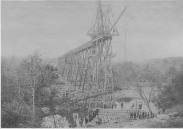
Bridge construction on the N&W Line, ca. 1892.

tunnels), river scenes, rural homes and families, and survey equipment.