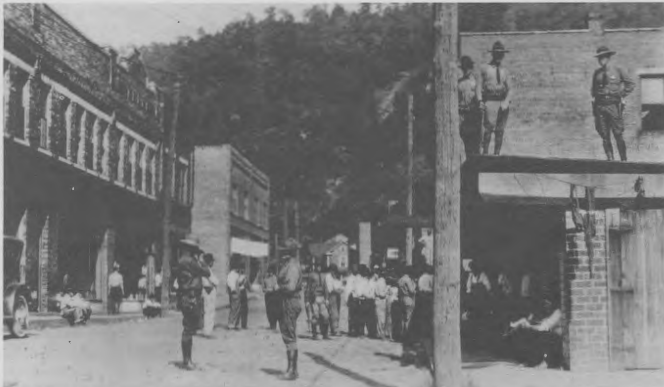
Federal troops keep peace in Matewan in the weeks following the Matewan Massacre, summer 1920.

Creek, as well as their role in Colorado's infamous "Ludlow Massacre" in which twenty miners and family members were killed, more than half of them children.