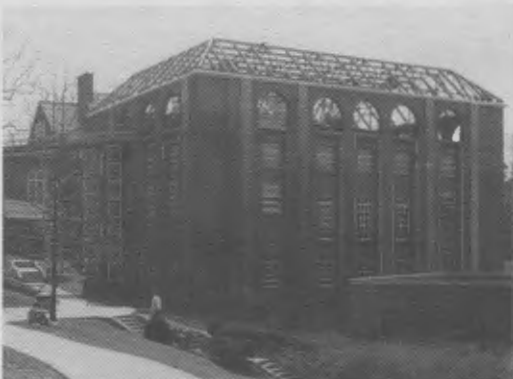
Elizabeth Moore Hall, ca. 1961. See story page 1.

Nonprofit Organization U.S. Postage PAID Morgantown, WV Permit No. 34