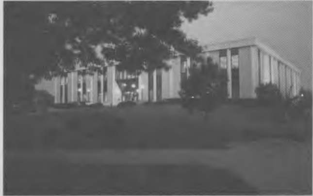
The Evansdale Library was built so as to permit the construction of additional floors in the future. A university museum was proposed for the building's third level.