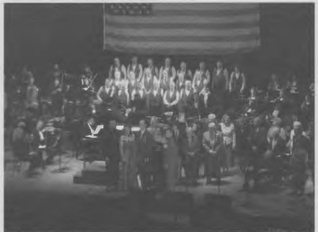
The cast of "Remembering 'Its Wheeling Steel,'" April 20, 2006.

Longfellow wrote that "History casts its shadow far into the land of song." In this instance, it was the land of song's history that cast its shadow on the present, resurrecting a bygone era when tube cutters and stenographers were the American idols of the day. Though the age of such wholesome and heartwarming entertainment is unfortunately long past, those who wish to step back in time can do so thanks to the 'It's Wheeling Steel' archives in the West Virginia and Regional History Collection.