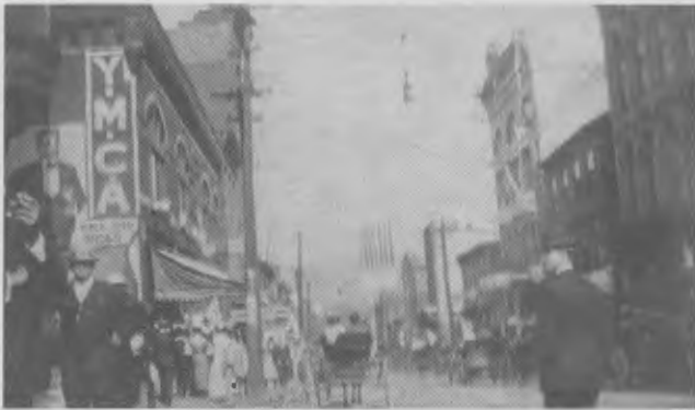
A booming Grafton, WV, ca. 1905.